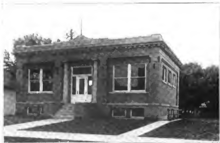
PUBLIC LIBRARY, GARNER